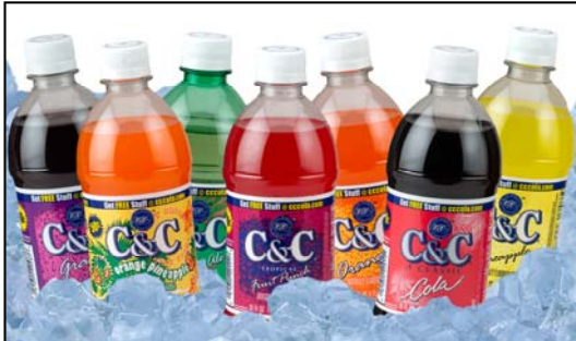
Pictured Above: The seven original flavors of 20oz "Chilling Out" in an ice bath

The release of the 20oz line of sodas in 2009 proved to be an instant success. Originally introduced in the top seven C&C flavors; Classic Cola, Ginger Ale, Fruit Punch, Grape, Orange,